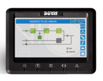
*Optional touch screen display (on 60-160 kW UPS)