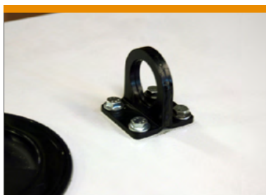
LIFTING HOOK GANCIO DI SOLLEVAMENTO