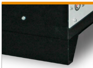
SELF SUPPORTING FRAME TELAIO AUTOPORTANTE